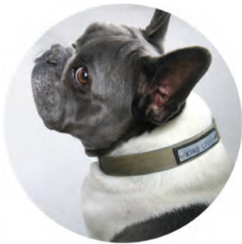
LEATHER PET COLLAR

AVERAGE DURATION: 2 hours CHALLENGE LEVEL: ●●●○