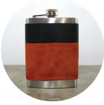
CUSTOM LEATHER HIP FLASK

-variety of leather dyes to choose from -jar included -stamp or carve in anything you desire!