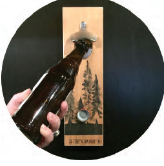
MAGIC CATCH BOTTLE OPENER

-made from scratch -paint & personalize any way you desire