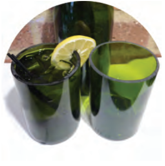
WINE BOTTLE TUMBLERS

-bottle opener included -paint a variety of colors - NOT ELIGIBLE FOR HALF PRICE 2nd PROJECT