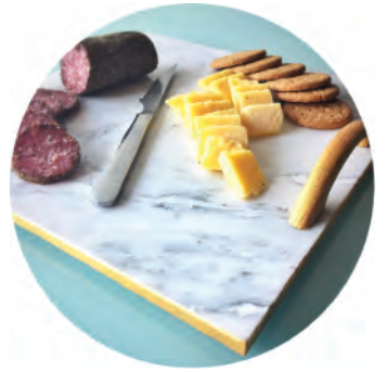
STONE SERVING TRAY

AVERAGE DURATION: 1 hour CHALLENGE LEVEL: ●○○○