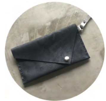
LEATHER WRISTLET CLUTCH

-set of two tags -dye a variety of colors -choice of accent stitching -personalize as desired