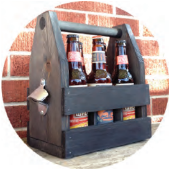
WOODEN 6-PACK CARRIER

AVERAGE DURATION: 2 hours CHALLENGE LEVEL: ●●●○