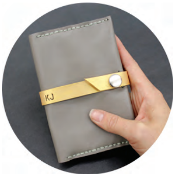
LEATHER PASSPORT WALLET

-variety of leather colors & dyes -customize with lettering