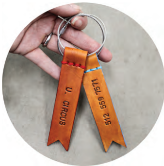
LEATHER LUGGAGE TAGS

-variety of dye & leather colors -make to your pets neck size *bring in an old collar or measure your pets neck size to ensure fit!