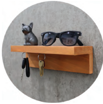
MAGIC MAGNETIC SHELF

AVERAGE DURATION: 1.5 hours CHALLENGE LEVEL: ●●○○