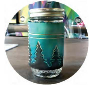
CUSTOM LEATHER KOOZIE

-set of two tumblers -cut and sand glass by hand