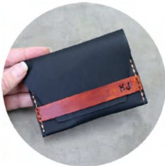
LEATHER CARD WALLET

-variety of design options & leather colors