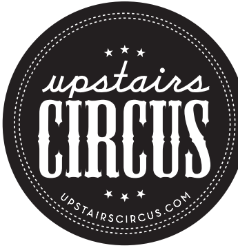
TABLE RESERVATION PACKAGES

AVAILABLE DURING PRIME TIMES : TUESDAY-FRIDAY from [7pm-10pm] and SATURDAY & SUNDAY [ALL DAY]