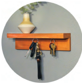
MAGIC MAGNETIC SHELF

AVERAGE DURATION: 1.5 hours CHALLENGE LEVEL: ●●○○