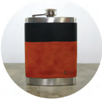
CUSTOM LEATHER HIP FLASK

-variety of leather dyes to choose from -jar included -stamp or carve in anything you desire!