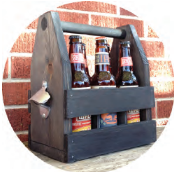
WOODEN 6-PACK CARRIER

AVERAGE DURATION: 2 hours CHALLENGE LEVEL: ●●●○○