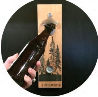
MAGIC CATCH BOTTLE OPENER

-made from scratch -paint & personalize any way you desire