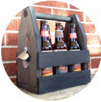
WOODEN 6-PACK CARRIER

AVERAGE DURATION: 2 hours CHALLENGE LEVEL: ●●●○