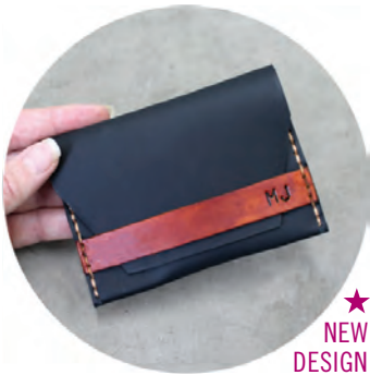
LEATHER CARD WALLET

-variety of design options & leather colors