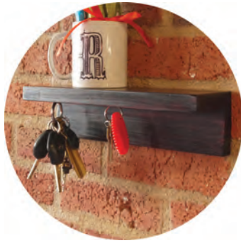
MAGIC MAGNETIC SHELF

AVERAGE DURATION: 1.5 hours CHALLENGE LEVEL: ●●○○