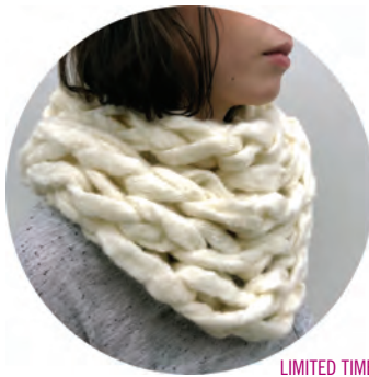
ARM KNIT INFINITY SCARF

-variety of leather colors & dyes -personalize as desired