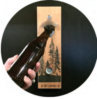
MAGIC CATCH BOTTLE OPENER

-made from scratch -paint & personalize any way you desire