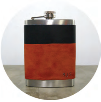
CUSTOM LEATHER HIP FLASK

-variety of leather dyes to choose from -jar included -stamp or carve in anything you desire!