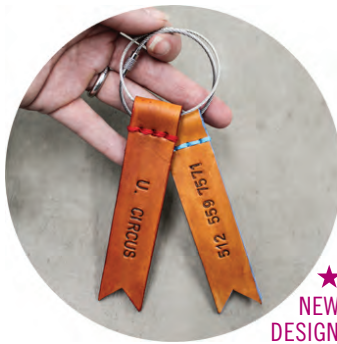
LEATHER LUGGAGE TAGS

-variety of dye & leather colors -make to your pets neck size *bring in an old collar or measure your pets neck size to ensure fit!